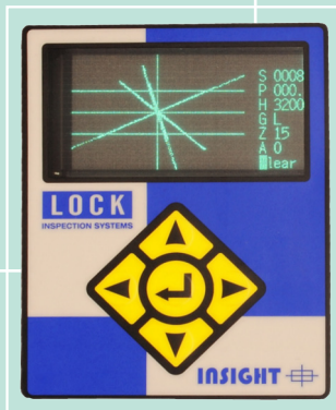
DDS (Direct Digital Signal)